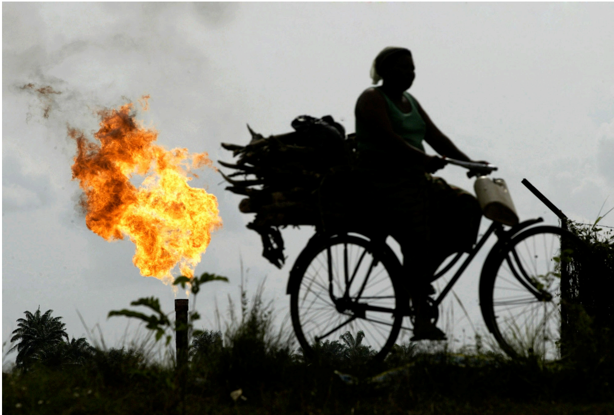
George Osodi: Ebocha Gas Flare, 2004, digital image